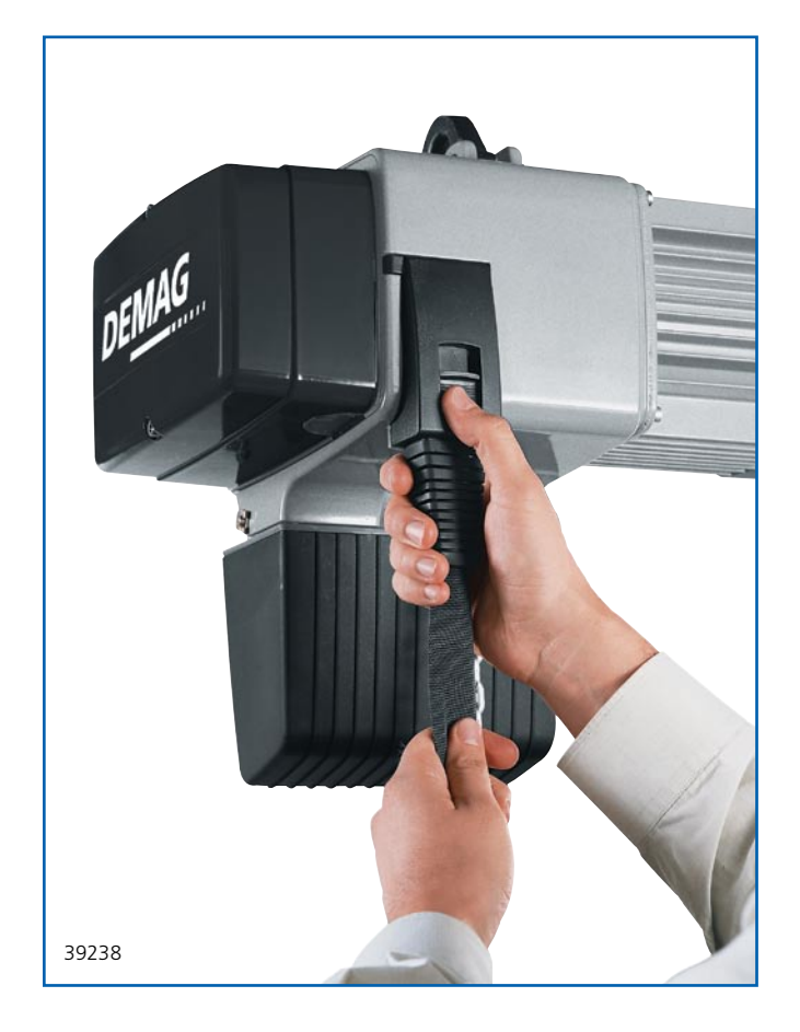
Height-adjustable control cable

The DC-Pro product range offers a wide variety of functions and options for a broad range of applications.